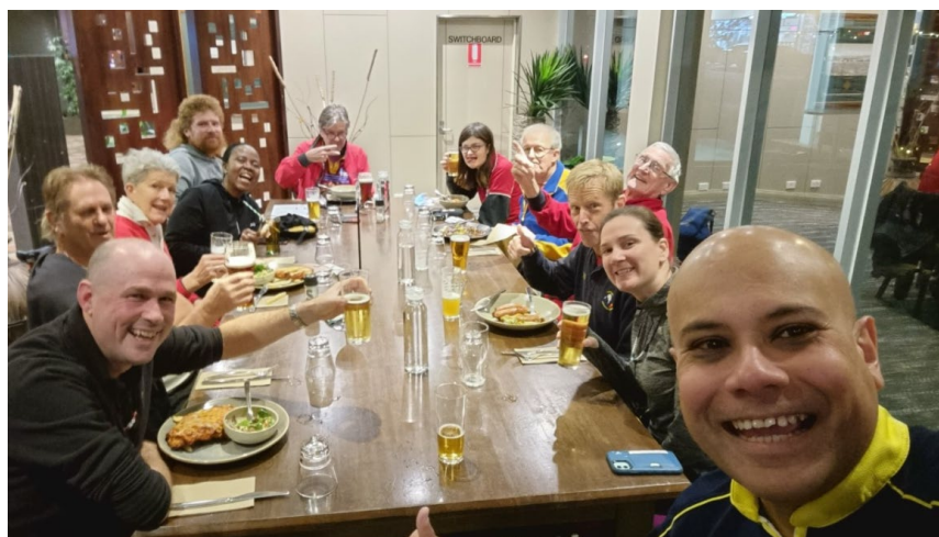
Dinner & On After